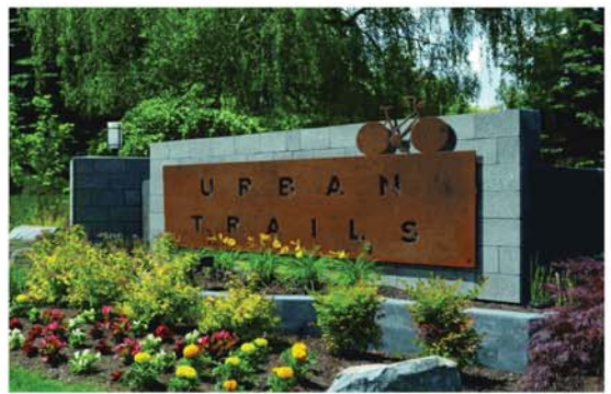
Proposed Entry Sign