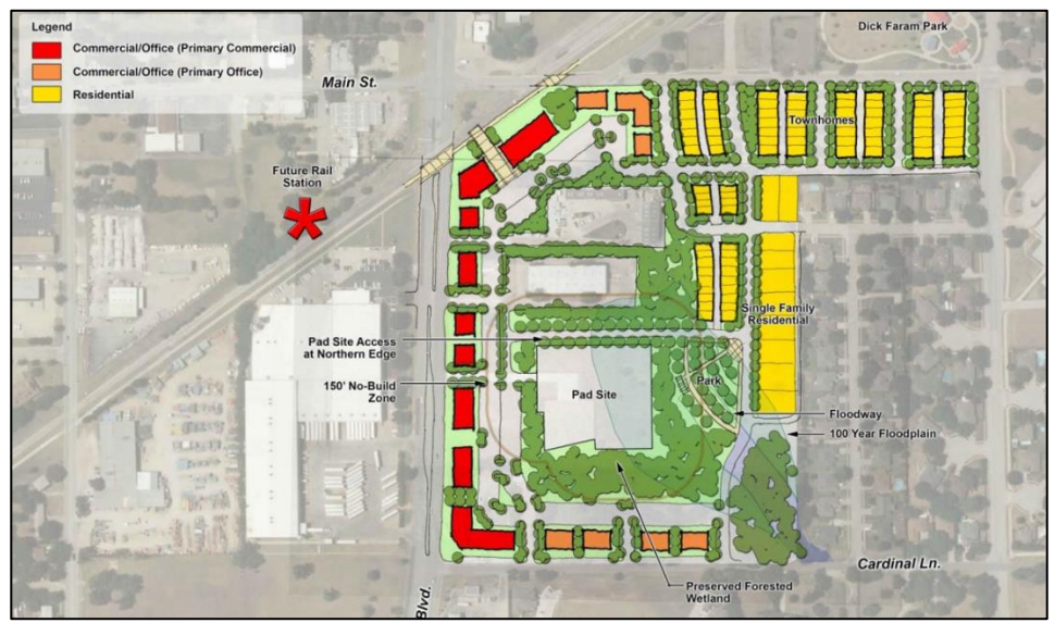
2014 CONCEPTUAL MASTER PLAN (ORDINANCE 3348)

On the subject property, a street connection was proposed to connect Davis Boulevard to the rear of the site and provide circulation to Main Street and Cardinal Lane. A condition of approval of the SDP was that this street connection be dedicated as right-of-way and the street constructed to meet TOD standards. The street connection is a requirement of the Smithfield TOD regulating plan, which establishes the general location of streets and functions as a refinement of the Transportation Plan. The graphics below show the concept plan and the TOD regulating plan.