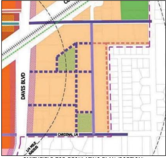
SMITHFIELD TOD REGULATING PLAN (PORTION)