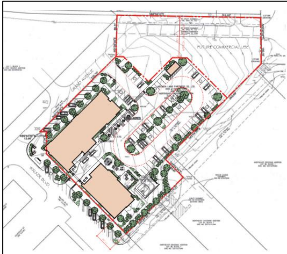
PREVIOUSLY APPROVED CONCEPT PLAN

revisions discussed above. Since this is a proposed amendment to the overall special use permit, these conditions may be modified throughout the public hearing process, but they are subject to final approval by City Council.