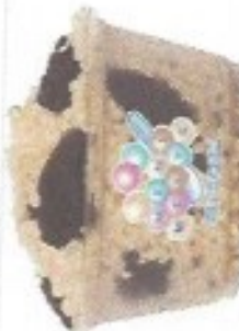
Cookies and Cream

Places made with egg in a facility that handles nuts