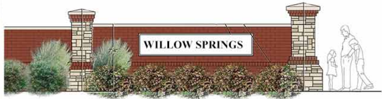
ENTRY WALL AND SIGN

FENCING ON RESIDENTIAL LOTS ADJACENT TO OPEN SPACE. 6' HT. FENCE TOP RAIL TO STEP IN 6" INCRIMENTS AT POSTS