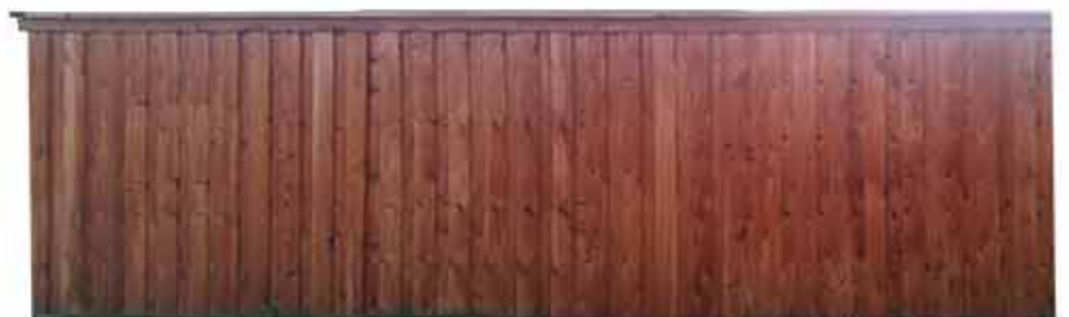
BOARD ON BOARD FENCING

MASONRY SCREEN WALL ADJACENT TO DAVIS BLVD. WALL HT TO STEP IN INCRIMENT OF 6" 6" AT COLUMNS