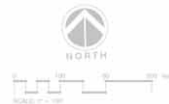
OPEN SPACE PLAN

OPEN SPACE WITHIN THE NEIGHBORHOOD SHALL PROVIDE OPPORTUNITIES FOR GATERING AND RECREATION. AMMENITIES SHALL INCLUDE BENCHES, LIGHTING, BIKE RACKS AND WASTE RECEPTICLES. PLANTINGS SHALL INCLUDE NATIVE TREES AND POLLINATOR GARDENS.