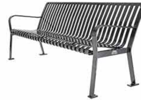
VICTOR STANLEY BENCHES