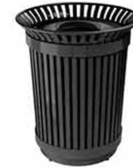
VICTOR STANLEY TRASH RECEPTACLES