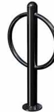
VICTOR STANLEY BIKE RACK

OPEN SPACE WITHIN THE NEIGHBORHOOD SHALL PROVIDE OPPORTUNITIES FOR GATERING AND RECREATION. AMMENITIES SHALL INCLUDE BENCHES, LIGHTING, BIKE RACKS AND WASTE RECEPTICLES. PLANTINGS SHALL INCLUDE NATIVE TREES AND POLLINATOR GARDENS.