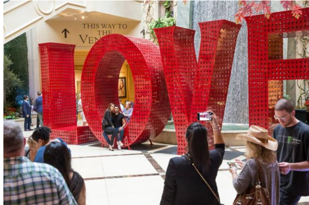
(Photos examples of love themed public art installations as place-making spots in communities)