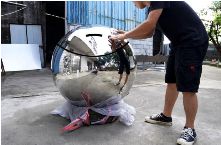
A design based on an oversized garden gazing ball with a highly reflective surface or brightly powder-coated surface and lock box mechanism is one possible idea.

Partnership with NRH Services or other Community Resources: The Help Station: Sample inspiration photos.