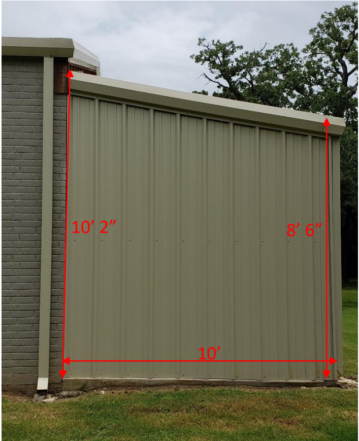
7504 Bursey Road – Covered Equipment Area