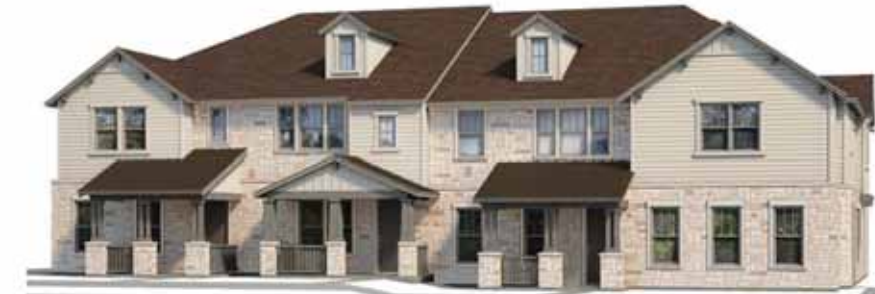
Exterior Color Scheme – C