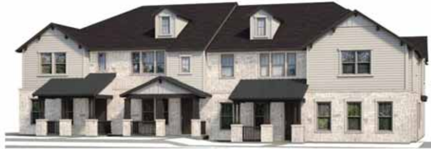
Exterior Color Scheme – A