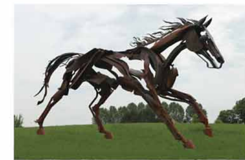
HORSE SCULPTURE N.T.S.