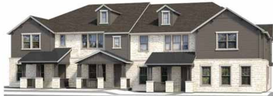
Exterior Color Scheme – D