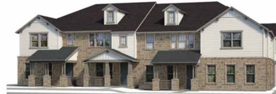
Exterior Color Scheme – E