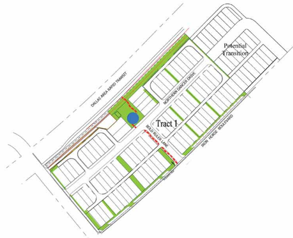
PREVIOUSLY APPROVED CONCEPT WITH 12% OPEN SPACE