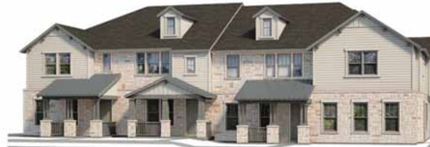
Exterior Color Scheme – B