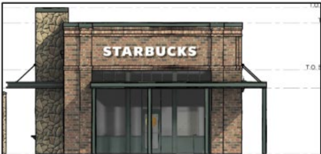
EAST ELEVATION PRELIM

MARBLE: 9% (BRICK AND STONE) FIBER CEMENT PANELS: 91%