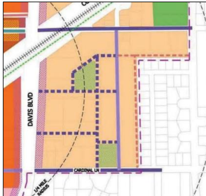
SMITHFIELD TOD REGULATING PLAN (PORTION)