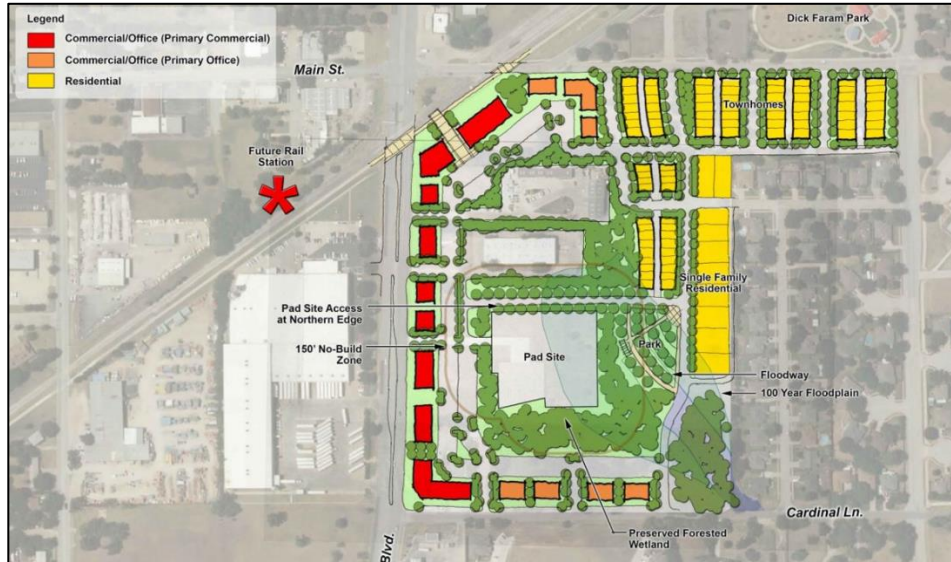
2014 CONCEPTUAL MASTER PLAN (ORDINANCE 3348)

On the subject property, a street connection was proposed to connect Davis Boulevard to the rear of the site and provide circulation to Main Street and Cardinal Lane. A condition of approval of the SDP was that this street connection be dedicated as right-of-way and the street constructed to meet TOD standards. The street connection is a requirement of the Smithfield TOD regulating plan, which establishes the general location of streets and functions as a refinement of the Transportation Plan. The graphics below show the concept plan and the TOD regulating plan.