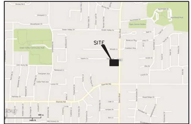
LOCATON MAP N.T.S.