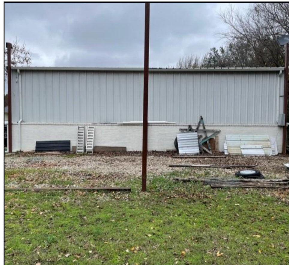
CURRENT VIEW OF BUILDING WITHOUT CARPORT