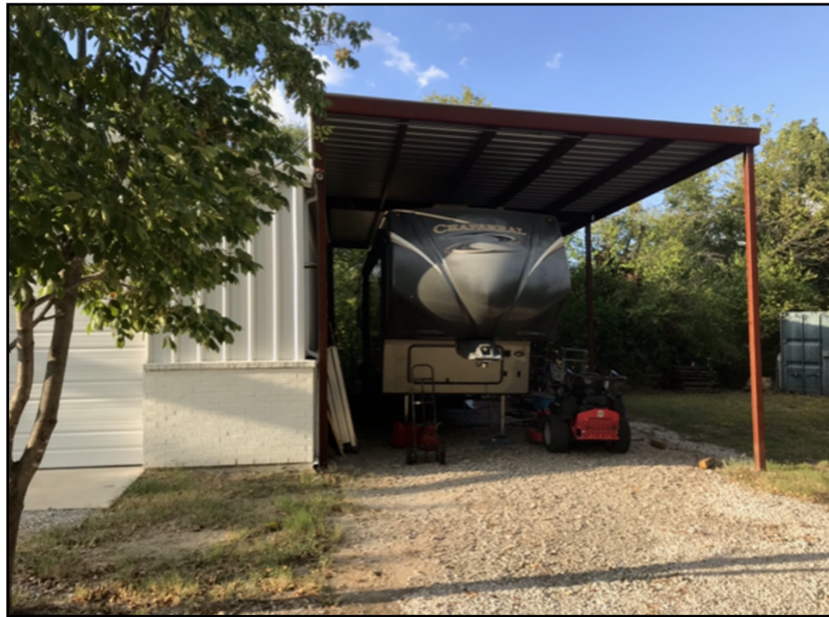
PREVIOUS CARPORT ATTACHED TO BUILDING