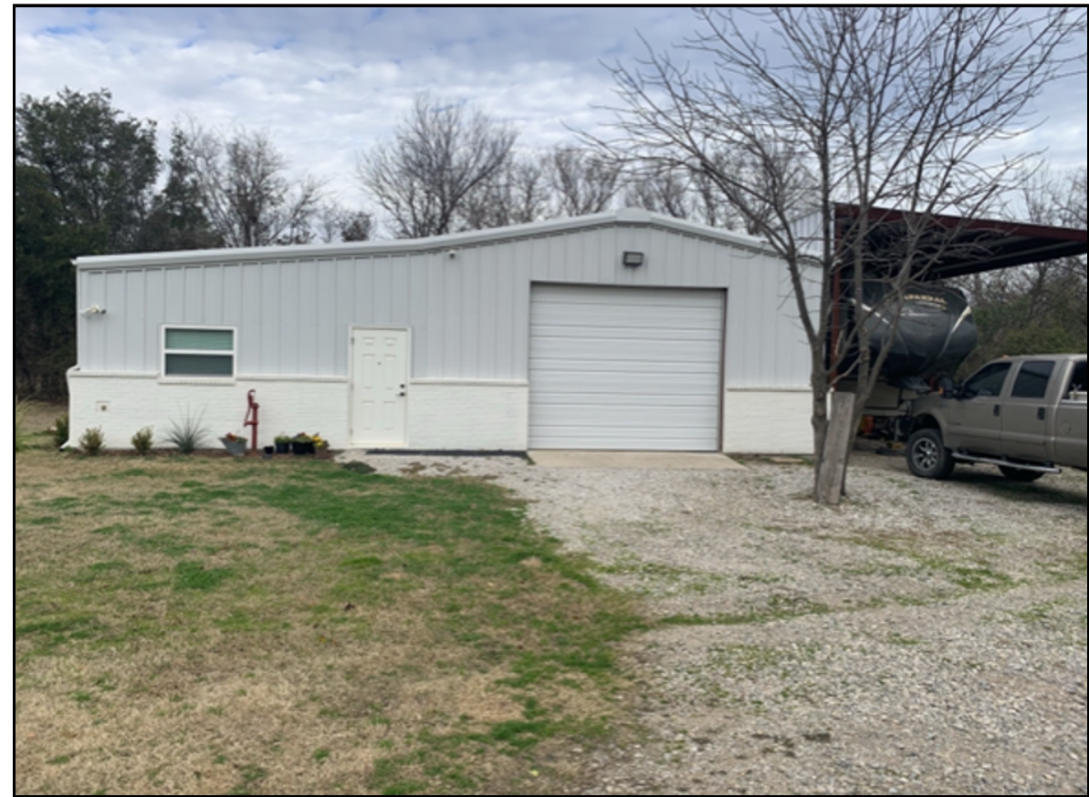
PREVIOUS CARPORT ATTACHED TO BUILDING