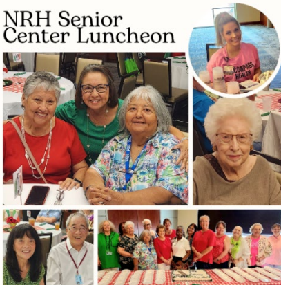
NRH Senior Center Luncheon