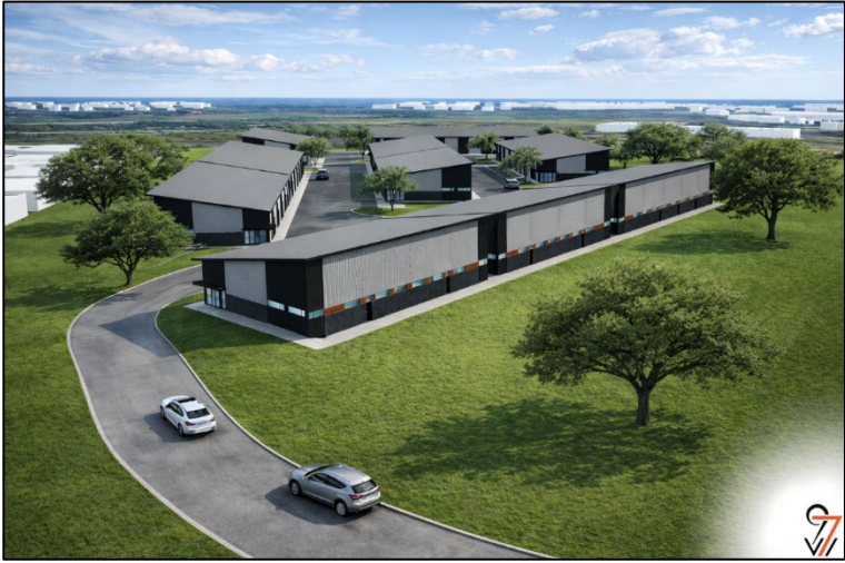
CONCEPTUAL IMAGES. SUBJECT TO CHANGE.