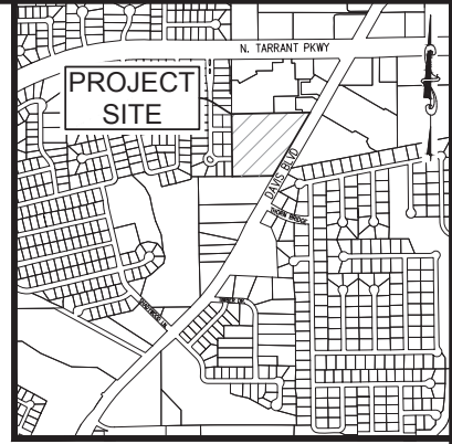
Viointy Map 1"=1000'

WHEREAS the Planning and Zoning Commission of the City of North Richland Hills, Texas, voted affirmatively on this ____ day of _____, 2021, to recommend approval of this plat by the City Council. Chairman, Planning and Zoning Commission Attest: Secretary, Planning and Zoning Commission