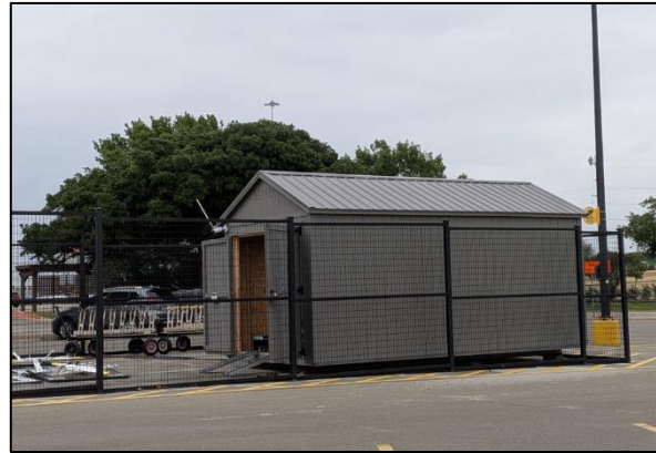
TYPICAL WING OPERATIONAL AREA (NE LOOP 820)

A 200-square-foot storage shed would house the drone aircraft and some of the associated equipment during operational downtimes. A storage container would not normally be permitted in the front of a building, and if it were located to the side or rear of the building it would be required to be screened with a masonry fence. Even with the loss of 31 parking spaces, the property still meets the minimum parking standards. Drive aisles in the parking lot are not blocked by the nest.