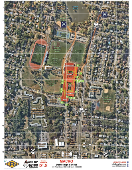
Each campus gets a “MACRO” CRG to coordinate response outside of a building

CRGs are standardized, site-specific and geo-rectified common operating pictures that combine facility floor plans, high resolution imagery and a gridded overlay together into one map. They include the accurate labeling of key features like room numbers or descriptions, hallways, external doors, stairwells, key utility locations, and parking areas. CRGs can enhance response time and improve command and control during an incident.