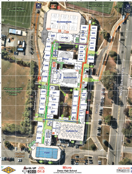
Each floor of a building gets a “Micro” CRG to coordinate response inside a building.

Critical Response Group, Inc., proudly proposes a mapping solution born from lessons learned by US Special Operation Forces (USSOF) and successfully transitioned for use by domestic public safety professionals. Our simple but sophisticated communication tool, called a Collaborative Response Graphic® (CRG®), is usable under stress – regardless of safety discipline – to coordinate an emergency response inside and outside of a building.