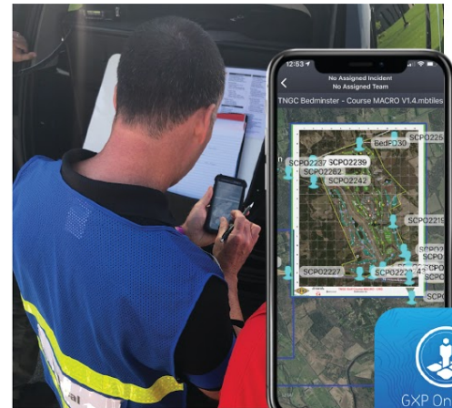
Phone / Tablet Integration