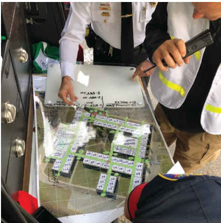
Printed maps at an incident command post

Our company’s origins are grounded in thousands of real-life direct-action raids conducted by USSOF over the past two decades and dozens of county-wide mapping deployments domestically over the past three years. Our management team’s mix of decorated and combat-tested USSOF officers and senior law enforcement executives has given us a unique perspective on building and implementing CRGs for domestic first responders, with a focus on CRGs being used when a crisis occurs. Our commitment to you is that CRGs will be easily accessible to those who need them and will increase the readiness level for public safety professionals during emergency situations.