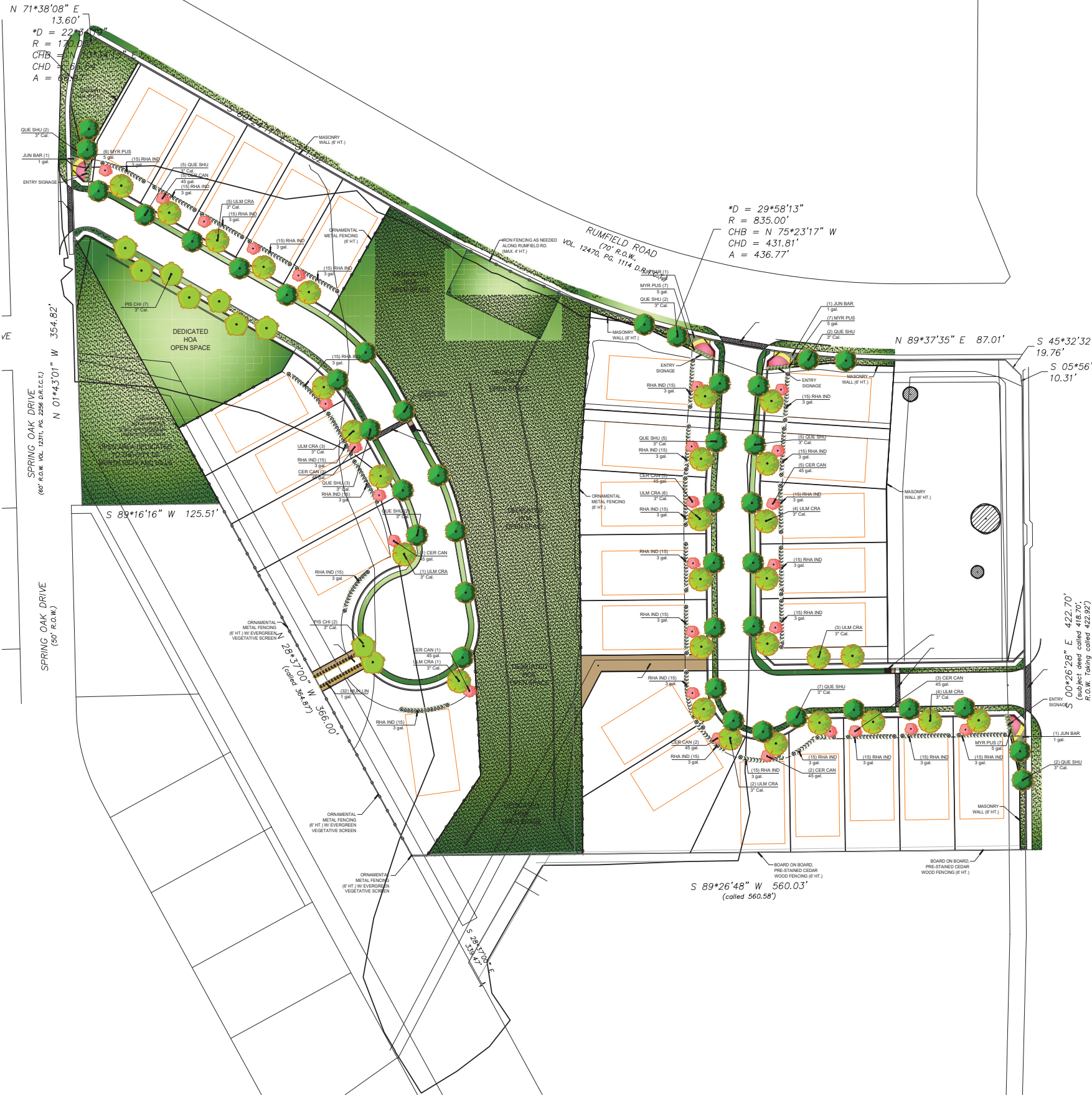
REFERENCE SHEET L-4 FOR PLANTING DETAILS, LEGEND, AND NOTES